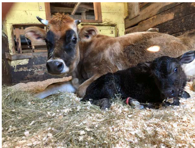
Ella and Norman

As with many of you living in the Northeast, I am anxious for warmer days and stripping off the winter layers. Trading in the ice chopper for a garden tool and animals on green pastures